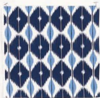
Sarong* polyacrylic by Schumacher.