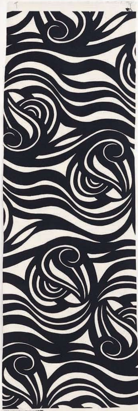
OD Oslo* acrylic by Clarence House.