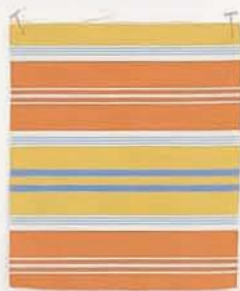
Picnic Basket* Bella-Dura by Robert Allen.