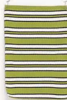
Baja Stripe* acrylic by Donghia.