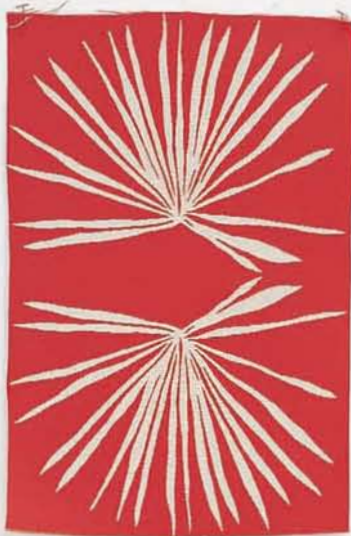
Palm* Bella-Dura by Hable Construction.