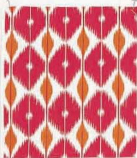
Sarong* polyacrylic by Schumacher.