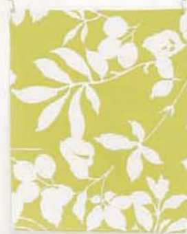
Wind Silhouette Sun N Shade spun-polyester duck by Waverly.