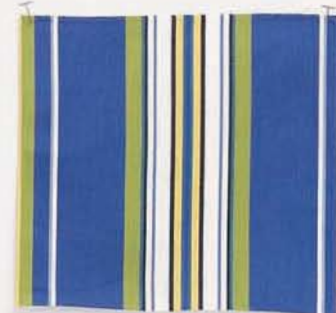
Beach Stripe Sunbrella by Ralph Lauren Home.

*Available to the trade only. See Resources.